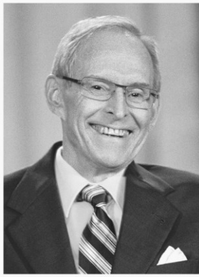
Harold Klemp The Spiritual Leader of Eckankar